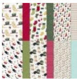
Sweet Little Stockings