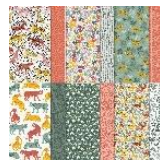
In the Wild