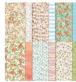
You're a Peach