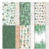
Bloom Where You're Planted