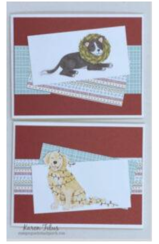
The last two 2" \ge 4" strips will used like this. Two of the 1-1/2" \ge 2" strips are used on the sides of these cards as well to provide some contrast. The white pieces are also 2" \ge 4" so the same size as the Designer Series Paper.