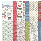
Trimming the Town