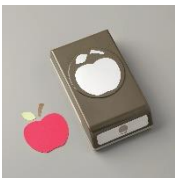
Apple Builder Punch