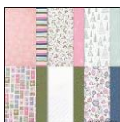
Whimsy & Wonder