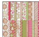
Gingerbread & Peppermint