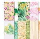
Expressions in Ink