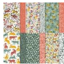
In the Wild