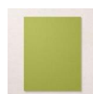
Old Olive cardstock 100702