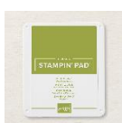
Old Olive 147090