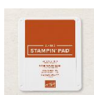
Cajun Craze 147085