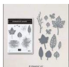
Gorgeous Leaves Bundle