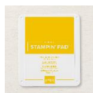
Crushed Curry 147087