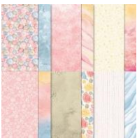
Sand & Sea