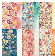
Fine Art Floral