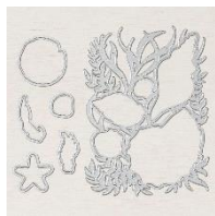
Seaside Shells Accents