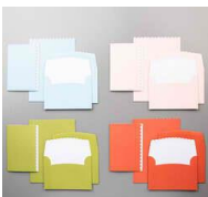
Scalloped Notecards & Envelopes