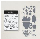
Cup of Tea Bundle 158667