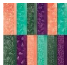
Pretty Prints 159245