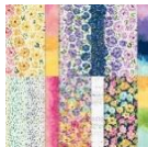
Hues of Happiness 158822