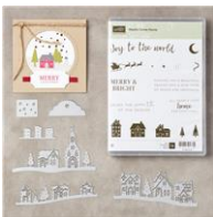
Hearts Come Home Bundle