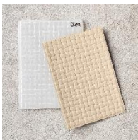
Basket Weave Folder