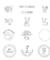
It's a Good Day