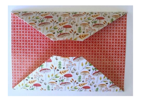
Next, fold on those two score lines to meet in the center.