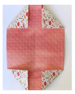
Fold each of the four corners in - close to but not on the 3-1/4" and 8-3/4" score lines.

Start with an 8" \times 12" piece of Designer Series Paper. Along the 8" side, score right down the middle at 4". Rotate and score at 3-1/4" and again at 8-3/4".