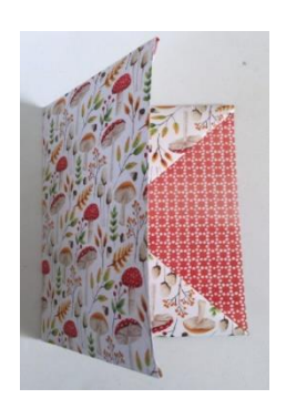
Fold in half and add ribbon and any other embellishments.

For more instructions, check out my video on YouTube: