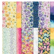
Hues of Happiness