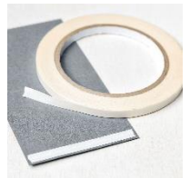
Tear N Tape