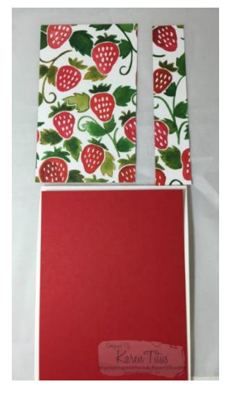
Cut the Designer Series Paper into 5" x 4", cut off 1" on the long end and flip it over. Attach it to the card – there will be a little overlap which looks good since it accents the change of paper.