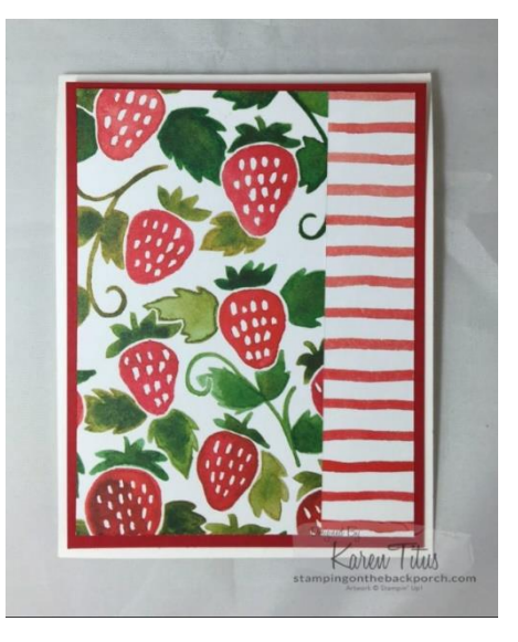
With one sheet of Designer Series Paper, you will get six 5" x 4" pieces, leaving a 2" strip at the end for other projects. Since you get two of each of the papers in the set, you can make twelve of each of the cards.

For more instructions, check out my video on YouTube: