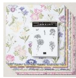
Wonderful World 159918