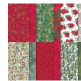
Boughs of Holly 159600