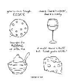
A Little Cheesy 159131