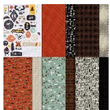
He's the Man 159068