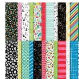
Celebrate Everything 159913