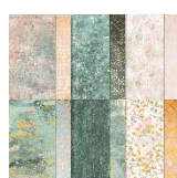
Texture Chic 158808