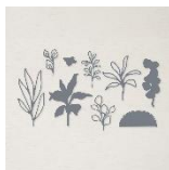
Splendid Stems Die 159676