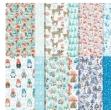
Storybook Gnomes DSP 159615