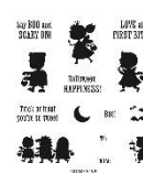
Scary Cute stamp set 159850