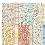
Rings of Love DSP 159939