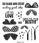
Best Butterflies stamp set 159114