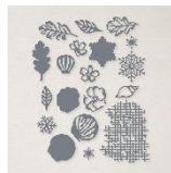
Chic Dies 158815