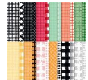
Gingham Cottage DSP 159651