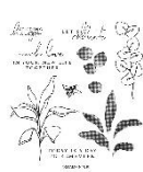
Splendid Thoughts 159668