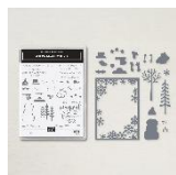
Snowman Magic Bundle 159818