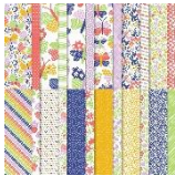
Butterfly Kisses DSP 159112