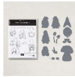
Kindest Gnomes Bundle 159626