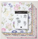
Wonderful World 159918