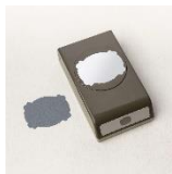
Lasting Label Punch