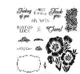
Lovely & Lasting