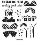
Best Butterflies 159114