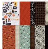
He's the Man