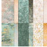
Texture Chic 158808