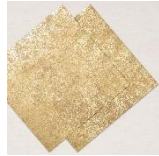
Distressed Gold 159237