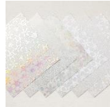
Snowflake Specialty 159832