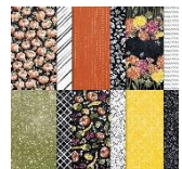
Rustic Harvest 159633