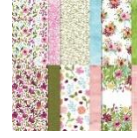
Awash in Beauty