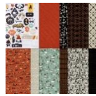
He's the Man