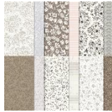
Abigail Rose 159037