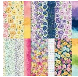
Hues of Happiness 158822