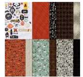
He's the Man 159068