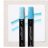
Tahitian Tide 159221