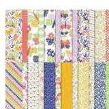
Butterfly Kisses 159112