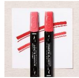
Sweet Sorbet 159224