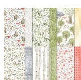
Happy Forest Friends 158941