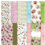
Awash in Beauty 158973