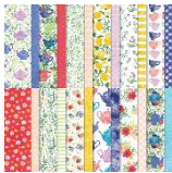
Tea Boutique 158659