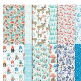
Storybook Gnomes 159615