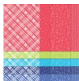
2022-2024 In Color