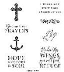
Hope & Prayer