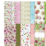
Awash in Beauty