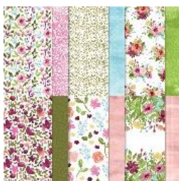
Awash in Beauty