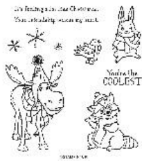
All Bundled Up