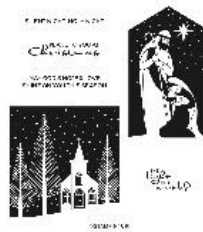
Peace to You