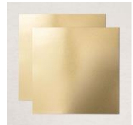
Gold Foil Sheets