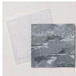
Into the Clouds