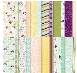
Design a Daydream