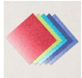
In Color Glimmer Paper