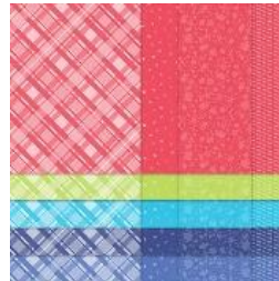
In Color 6" x 6" DSP