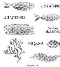
A Fish & A Wish