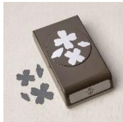
Flowers & Leaves