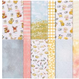
Rain or Shine