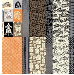
Ready to Ride