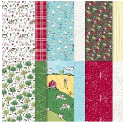
Day at the Farm