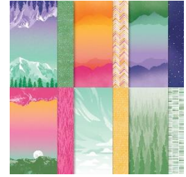
Enjoy the Journey