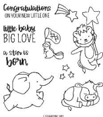
Little Dreamers 161569