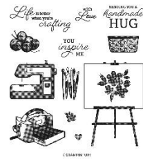
Crafting with You 161219