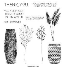
Earthen Textures 161504