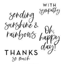
Kindest Expression 161415