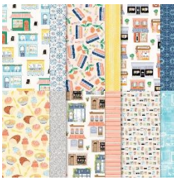
Les Shoppes 161322