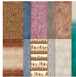
Earthen Elegance 161503