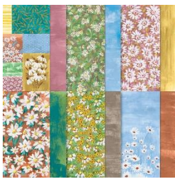
Fresh as A Daisy 161289