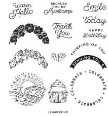
Circle Sayings 161348