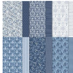
Countryside Inn 161467