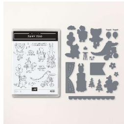
Zany Zoo 161315