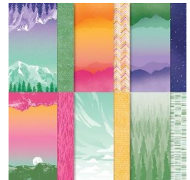
Enjoy the Journey