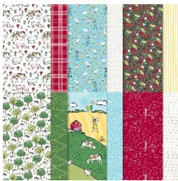
Day at the Farm