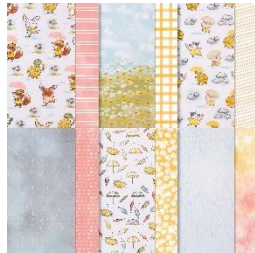
Rain or Shine