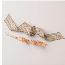
Copper & Natural Ribbon