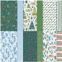
A Walk in the Forest