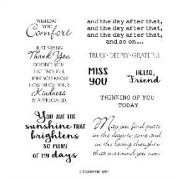
Hope You Know 161409