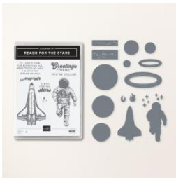
Reach for the Stars 161186