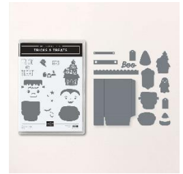
Trick & Treats 162226