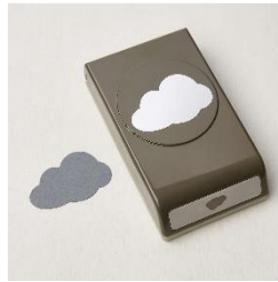
Cloud Punch 157749