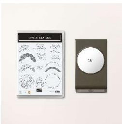
Circle Saying 161355