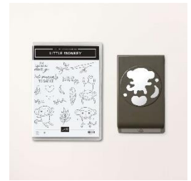
Little Monkey 161379