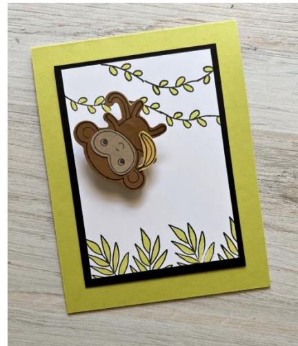
How about this adorable monkey that really swings!