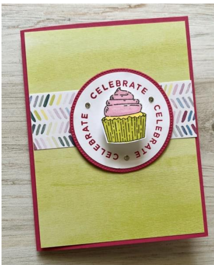
Birthday cards that move – the cupcake has the wobble attached.

For more instructions, check out my video on YouTube: