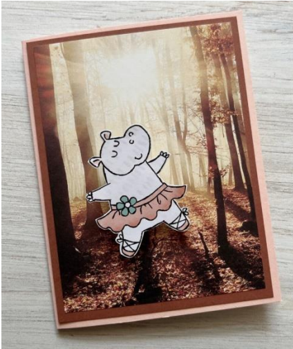
This happy hippo dancing in the sunlight in the middle of the woods looks as happy as can be!