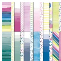
Bright & Beautiful 161449