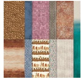
Earthen Elegance 161503