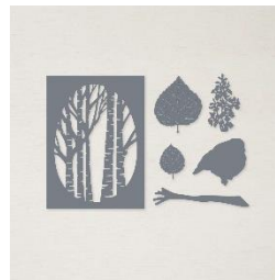
Aspen Tree 159798