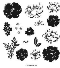
Two-Tone Flora 160844