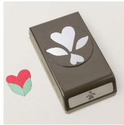
Country Bouquet 160382