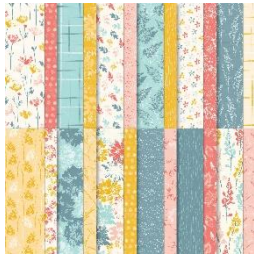
Inked Botanicals 161157