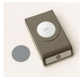
1-3/4" Circle Punch 119850