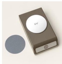
2-3/8" Circle Punch 161354